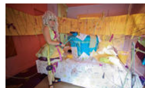
Showtel at Hotel Biba 2010